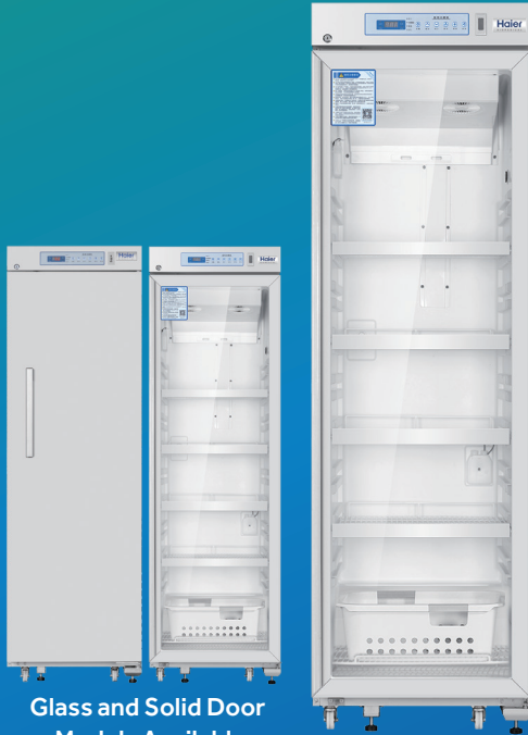
Glass and Solid Door Models Available